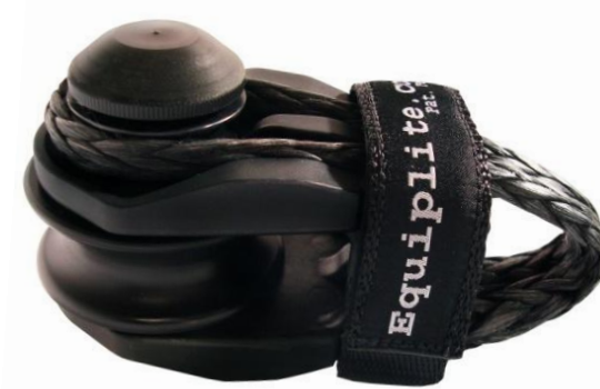
Low load version